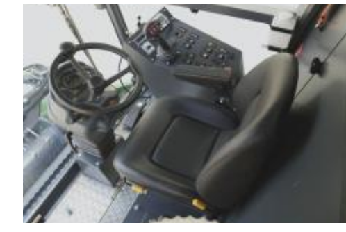
The comfortable cab with its clearly and ergonomically arranged control elements, including a multifunction lever.