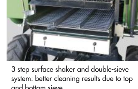
and bottom sieve.