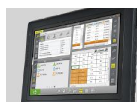
Harvesting data system (plot management) records valuable and immediately available data next to harvesting the plot.