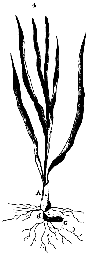
A Grain of Wheat sown on the 12th January, 1834, was in this state the 27th January following. 16 days sown.