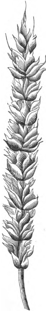
Triticum Koeleri , of La Gasca.