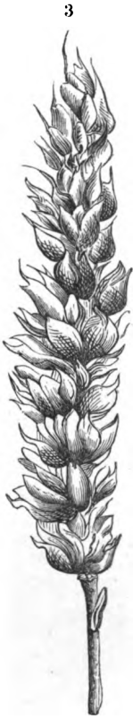
Triticum Hybridum. Coturianum à Compactum, of La Gasca.